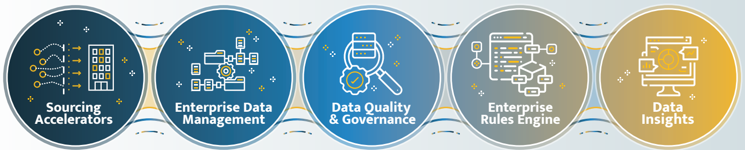
Figure 1 - ClearSense Data Fabric

The ClearSense Healthcare Data Model offers a comprehensive library of over 1,000 pre-built data integration tasks and mass ingestion designs. These resources are designed per industry-leading design pattern standards, ensuring adherence to best practices and accelerating implementations. The out-of-the-box functionality enables healthcare organizations to leverage standardized and efficient data integration and interoperability processes, saving time and effort in data mapping and ingestion. The dynamic capabilities of the ClearSense Healthcare Data Model eliminate the need to rebuild from scratch each time new dataset expands, enhancing flexibility and agility. The extensive collection of pre-built integrations provides a solid foundation for data management and analytics within the healthcare domains.